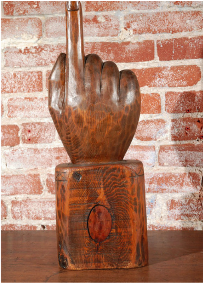
This large carved "hand to God" comes from an early 20th century Masonic Lodge in Wisconsin. The index finger pointing to the sky symbolizes the Sign of Preservation, a prayer for protection.

This Masonic item for sale at 1stdibs.com features the same hand sign as found in front of the IRS building.